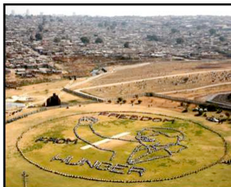
Honoring Nelson Mandela on his 90 th Birthday Johannesburg, South Africa

Focusing on themes of human rights, social justice, ecological balance, democracy, peace & freedom, Circle Up Now strives to liberate the spirit and inspire unity and action through creative participation.