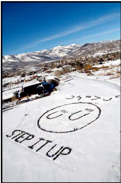
Sundance Film Festival Park City, Utah

Circle Up Now is a grassroots campaign that mixes art and activism, communication and community, education and empowerment -- enabling individuals across the globe to stand up and take action within a fun, celebratory environment.